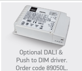
Optional DALI & Push to DIM driver. Order code 89050L.