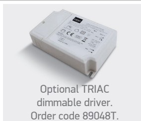
Optional TRIAC dimmable driver. Order code 89048T.