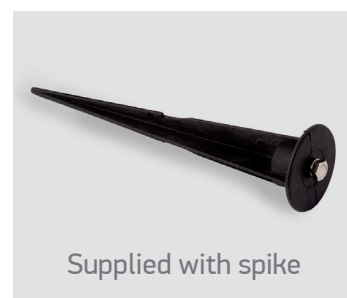
Supplied with spike